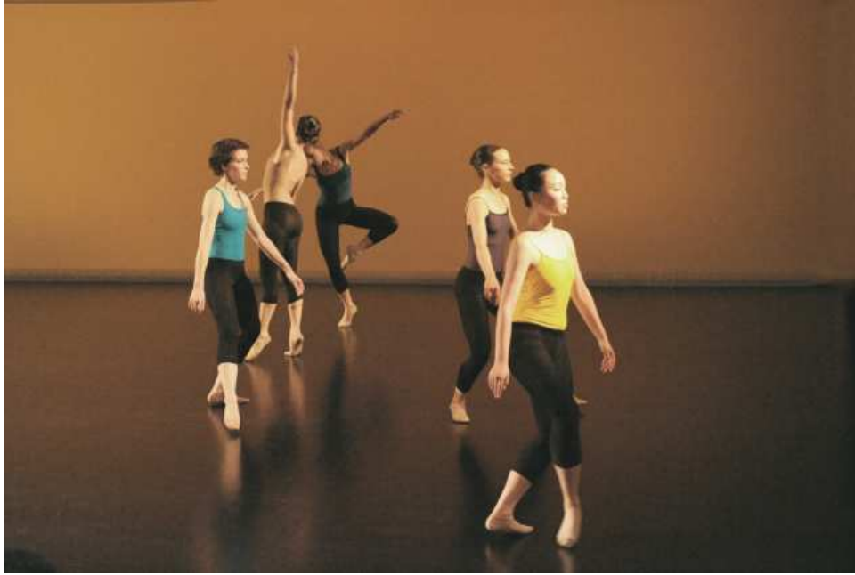
Figure 4 – Three dancers in the foreground within a collective motion while in the background, a pas de deux escapes from the group © Henriette Ponchon de St André//L'Atelier d'Images.