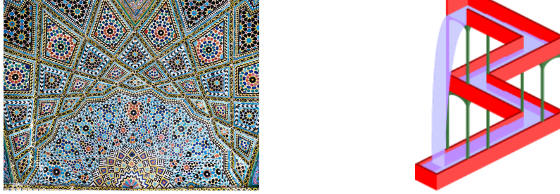
Figure 2: Two pictures of infinite