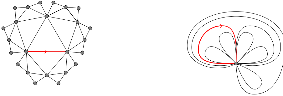
Figure 1.1. The beginning of the construction of \mathbb{T}_0 (on the left) and \mathbb{T}_* (on the right). Note that these are two different triangulations: \mathbb{T}_0 has infinitely many vertices whereas \mathbb{T}_* has only one.

In particular, this result means that there is no natural notion of "uniform" multi-ended planar triangulation. This was already observed by Linxiao Chen for a much stronger version of the Markov property [Che].