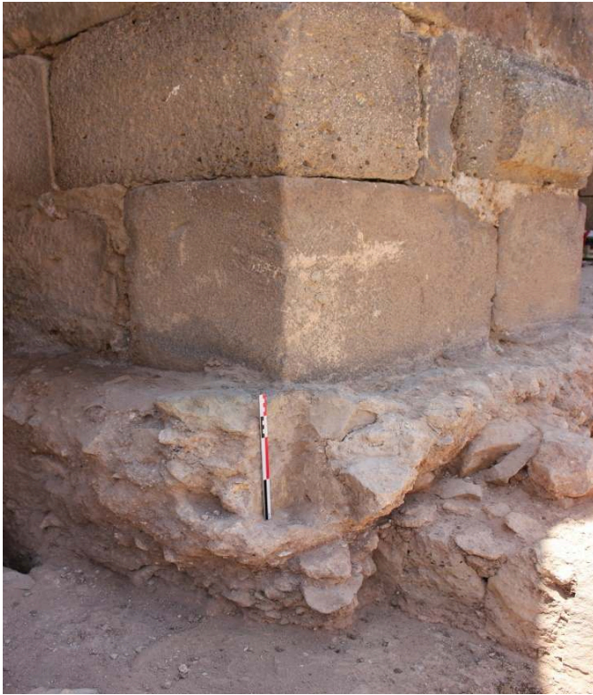
Fig. 3 – Relationship with the staircase pillar.