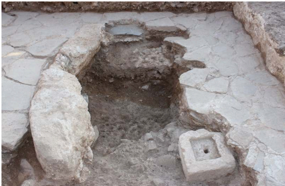
Fig. 5 – Detail of the central structure.