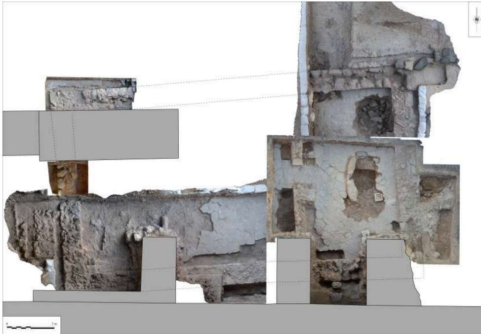
Fig. 4 – The plan of the lower building.

bound walls do not seem to have been able to support a second floor. The method of roofing is not known: one can exclude the tile, totally absent, and wonder about the possibility of a roof terrace when one notes the need for beams of 8 m long. Concerning the interior, one must insist on the care taken with the covering: floor paving and wall plastering, the presence of numerous benches in both rooms, suggest a reception function. However, we can't be more specific about it. Finally, although it could not be identified, the central structure of the room is undoubtedly an important element for the function and decoration of the whole ( Fig. 5 ).