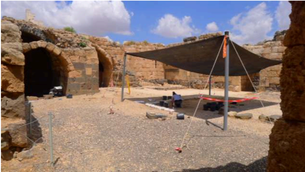
Fig. 1 – The survey in the centre of the court.